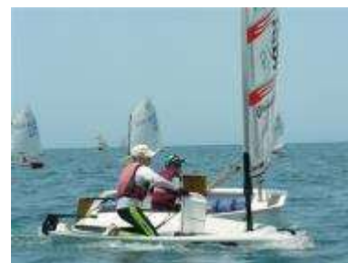
On the same course at Yeppoon 2013, Optimist 22min, Sabot 19min