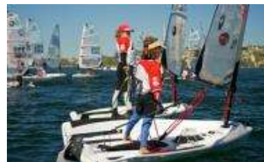
Sailors as young as 6 are

Rigged on an epoxy mast, the sail has been designed with an open leech to give sailors maximum control and performance in windy conditions.