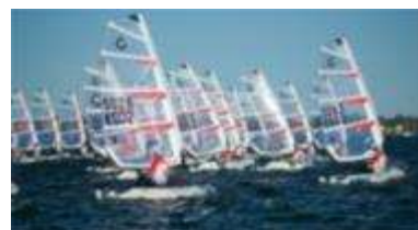
Bigger and more competitive fleets in Gold & Silver. Silver sail same course, shortened